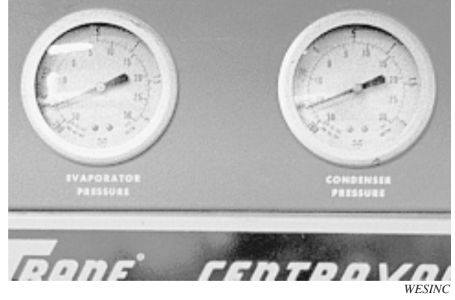
Fig. 2 Evaporator and condenser gauges These tell you immediately whether the machine has the minimum amount of refrigerant for efficient operation. They do not tell you the actual amount. The condenser pressure provides an uncertain indication of excessive charge.

If the refrigerant charge is low, both the discharge and suction pressures will be lower than normal. The discharge pressure is low because there is not enough gas in the system for the compressor to squeeze to the normal discharge pressure. The suction pressure drops