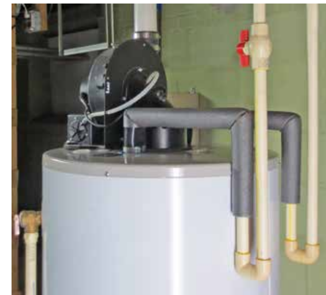
Figure 5-17 shows how pipe loops are installed. The descending legs can be short because the lighter hot water remains at the top. A drop of about 6” (15 cm) is ample. Pigtail loops in the inlet and outlet pipes have been used for the same purpose, and they probably work as well.

A simple, reliable way to avoid this energy waste is to install short descending legs in the tank’s inlet and outlet pipes. The lighter hot water at the top of the tank cannot drop into the denser cold water in the descending legs. As a result, the hot water cannot move by convection into the surrounding pipes.