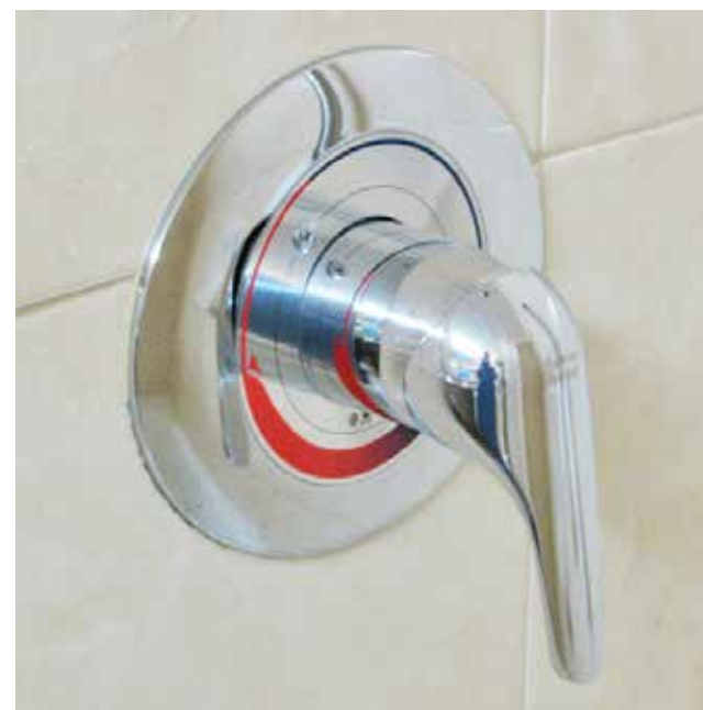
Figure 5-2. If you want a single-lever shower faucet, this is the right kind. Turning it right or left adjusts the temperature. Pulling the lever in or out adjusts the flow rate. A lever gives you better control than pulling a round knob in or out. You need a separate diverter valve to send the water to a low spigot, if you have one.

a recirculating hot water system (explained later), this kind of faucet first dumps cold water on the bather, and then adds the risk of scalding while the bather struggles to set the temperature.