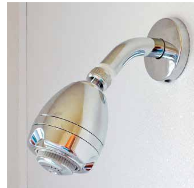
Figure 5-3. An adjustable shower head that is advertised as "water saving." Many shower heads make this claim. Select a unit that makes it easy to adjust the spray pattern with wet fingers. Make sure that the connecting pipe, or "gooseneck," is long enough to keep the shower head from dripping on the faucets below.

You will save water and energy if the shower head is easy to adjust. The easiest adjustment is a large butterfly knob on the side of the shower head. An adjustment ring around the perimeter of the head may be difficult to turn with wet hands. Avoid cheap units that have a knob in the center of the nozzle plate, forcing the user to reach through the spray to adjust it.