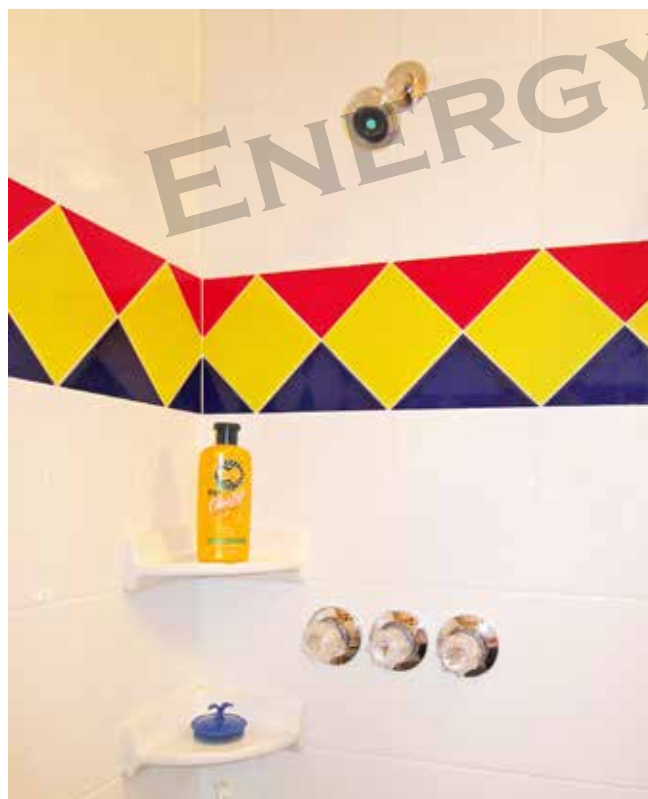
Figure 5-1. This classic arrangement of shower faucets, hot and cold with the diverter valve between them, usually is best. However, there are benefits in not locating the faucets under the shower head.

Homes also use a lot of water outdoors, mostly for lawns, shrubbery, and gardens. Outdoor water usage is seasonal. Variation among households is even greater than for indoor usage. Drier regions use the most outdoor water. For example, outdoor use accounts for 44% of average household water use in California, but only 7% in Pennsylvania.